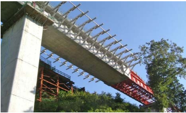
Fig. 5 Katsurajima Viaduct