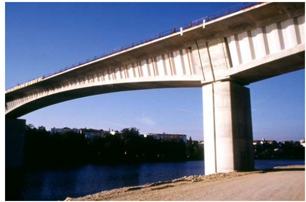
Fig. 4 Dole Bridge

It was the research of Shimada into the "ripple web" that represented the first use of corrugated steel in a main girder web [6]. Subsequently, the corrugated web bridge was developed in France as a hybrid bridge. (Fig. 4) However, the former design was developed in order to omit stiffeners, while the latter was developed to prevent the prestressing force from being transferred to the steel plates in order to reduce the weight of the main girders. Corrugated steel had been used for various applications up to that point, and although the progress of development was different in these cases, the idea of using corrugated steel in bridge webs greatly expanded the possibilities of bridges. In this sense, this is a classic example of performance-creative design.