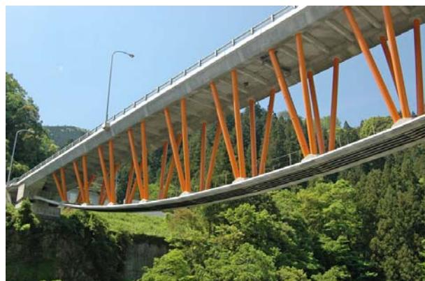
Fig. 7 Seiun Bridge

The Seiun Bridge (Fig. 7) has a span of approximately 100 m and extends across a deep valley. As this bridge was constructed inside a national park, it was not possible to put in place bridge piers and supports, even during the construction process. Moreover, there was very little work space for erecting a conventional arch bridge. The solution for these requirements was to conduct the erection using a suspension structure. By conversion from a ground anchored structure to a self-anchored structure after completion, the environmental impact was kept to a minimum. This is yet another example of performance-creative design and was awarded fib outstanding structures in 2006.