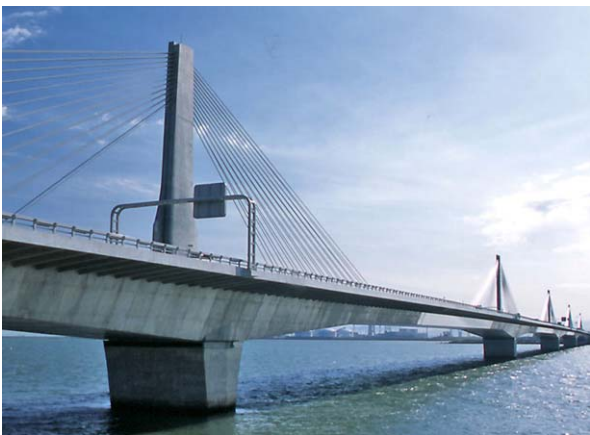
Fig. 3 Ibi River Bridge

precast segment method with a maximum weight of 400tf was employed. This enabled the construction to be completed in the shortest possible time while remaining unaffected by river conditions. In addition, prefabricated stays utilizing wires were used, and as a result of conducting fatigue design, serviceable stress was set to 0.6 fpu. Due to the lightweight design, shortened construction period, fatigue design for the stays and so on, the resulting bridges are an example of the creation of performance that is outside the scope of the code.