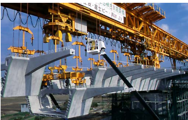
Fig. 6 Furukawa Viaduct

The U-shaped segments of the Furukawa Viaduct (Fig. 6) represent a solution to the construction requirements for this project, which involved reducing to the greatest extent possible the number of bridge segments. This was done under the conditions for transportation on public roads in Japan, in which regulations set the maximum weight limit at 30 tons. The unique segments have ribs for deck reinforcement. The U-shaped sections were used to make the bridge girders temporarily independent, with precast panels then being used to construct the deck. During placement of the deck concrete, however, the U-shaped segments that are low in torsional stiffness were subjected to torsional moment. FEM analysis was employed in the design, but in order to verify the design an actual scale single-span model was used to confirm safety. Detailed study and experimentation were conducted to confirm the aspects of the design that had no precedent. This embodies the fundamentals of performance-creative design.