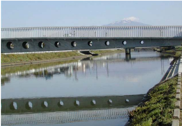
Fig. 8 Sakata Mirai Bridge [10]

its fine material structure provides it with high durability. This new material possesses great potential for performance-creative design.