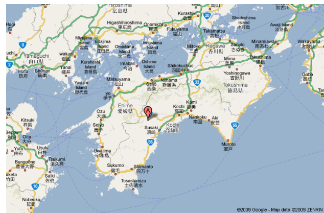
Figure 1 Location of Choja on the Shikoku Island

The next section provides a brief overview of the case study area and two of the recently launched community groups, trying to join forces with a view to regenerating the village. Then, the methodology we employed is described, highlighting how quantitative and qualitative methods were combined. Next, the preliminary findings from both quantitative and qualitative analysis will be described. In conclusions, the required future work is discussed.