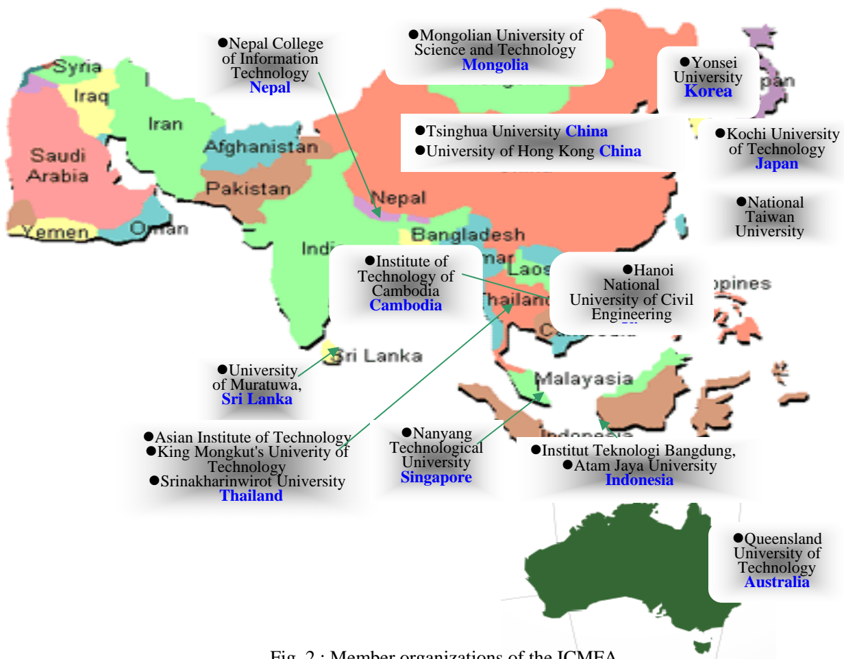
Fig. 2 : Member organizations of the ICMFA