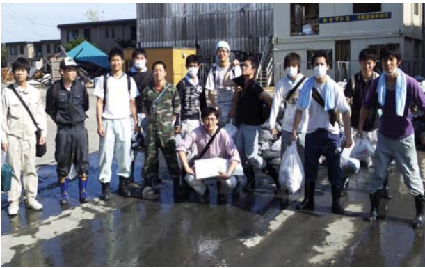
The volunteer activities by students and faculties in the disaster area in Ishinomaki city

The volunteer activities had been continued 3days