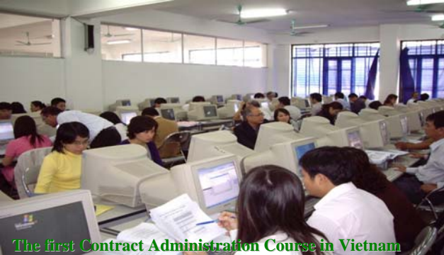
The first Contract Administration Course in Vietnam

In February 2007, the seminar implemented in AIT Bangkok accepted 23 participants from 11 countries and shown the expected outcome.