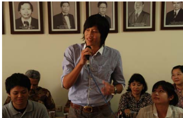
Discussion meeting between students of Atam Jaya University Indonesia and Kochi University of Technology at Atam Jaya University Yogyakarta Indonesia in September 2010

On 11 th March 2011, a magnitude 9.0 ( M_w ) earthquake caused by an undersea megathrust, occurred off the north eastern coast of the main Japanese Island of Honshu. The earthquake triggered an extremely destructive series of tidal waves or Tsunamis. The Tsunami was recorded at up to 40.5m above the sea level (as measured in Miyako City in Iwate prefecture) and the Tsunami was recorded traveled 10 kilometers inland in some areas. The Tsunami destroyed houses, factories, buildings,