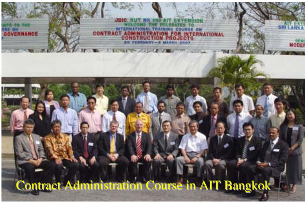
Contract Administration Course in AIT Bangkok