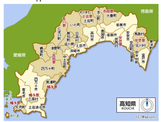
Figure 1 Kochi Prefecture

A case in this paper is on a construction company based in Ino area in Kochi prefecture. The company, that has been facing serious issues such as recession of construction industry due to a huge budget cut of the local public sector, is successful in an entirely new business, which is tea business. The company is Kunitomo Shoji K.K.(Kunitomo hereafter), which was established back in 1971, is located in typical mountainous area.