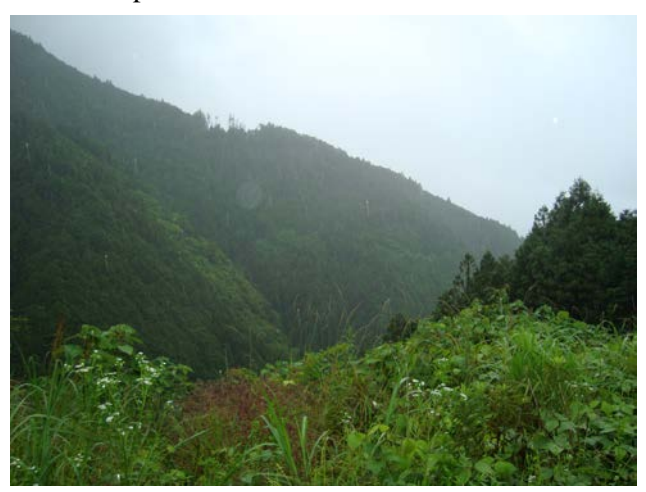
Figure 2 A view from mountains of Kunitomo

inorganic chemistry used. The scene of tea bushes growing is very different from ones seen in Uji, Kyoto, and Shizuoka, which are famous tea growing areas in Japan.