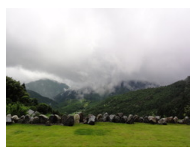
Figure 6 A view from the cottage

"Yama-gyo" concept makes us to understand this kind of possibilities as well.