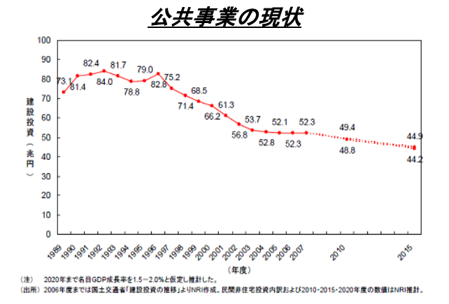
Table 1 Trend of budget of public construction

The company has only 40-year history. This company is not a typical long standing one. But, according to The Teikoku Databank and Nikkei's data mentioned above, this company is already over the average life span of companies in Japan. Not only Kunitomo, but also other construction companies, companies in construction industry are in very serious situation. The table below indicates the severeness of such business.