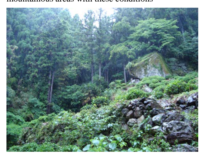
Figure 3 Tea bushes of Kunitomo

Teas from these forests and mountains are "Yama-cha", which means "naturally grown tea in forests and mountains. "Yama-cha" has very unique aroma and flavors. There are some conditions that grow good tea i.e., lots of rainfalls, but good drainage, lots of sunshine, but fog that produce ultra violet...these conditions give tender tea leaves for good aroma. Kochi Prefecture has many mountainous areas with these conditions