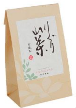
Figure 5 The Package